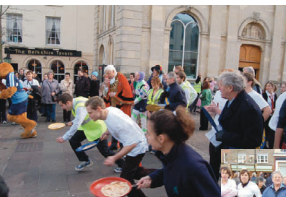
And they’re off!!