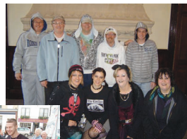
Above- Town Council runners