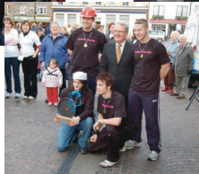
Left - This year’s winners—Newbury College

Pancake day came early to Newbury’s Market Place with the Newbury Soroptomists staging their annual pancake race. The Town Council entered two teams, who it could be said, were more willing than able!