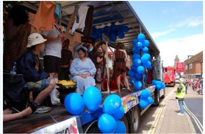
The float moves up to Bartholomew street where the judges will be waiting outside Cafe Nero. Get ready to grin everyone!