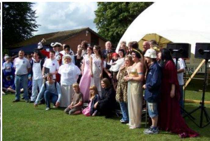
Well, here we are at the Kick FM stage in Victoria Park in the sunshine winning "Best Business Entry" again, albeit jointly this year with Pageant Fancy Dress Shop. Just a little gloat but I think we deserved it.

What a thoroughly stressful, chaotic, manic, hysterical, fabulously enjoyable day again. Was it all worth it? Judging by the amount of people that have said they really enjoyed themselves and are straining at the leash to do it all over again next year, then yes, it most definitely was. Again, Newbury showed that they can indeed come up with the goods and show how a Carnival should be. Our most grateful thanks for everybody who took part, in any way shape or form, from finding or making props, to blowing up balloons, to lending us your lorry and giving up your Sunday to drive it, to making the journey from a different county to help with the stewarding, to taking photos, to making costumes, for face painting - this list could go on forever and without you all it would not have been the huge success it undoubtedly was. The Carnival Committee are meeting soon to discuss the theme for next year's Carnival - anybody interested?