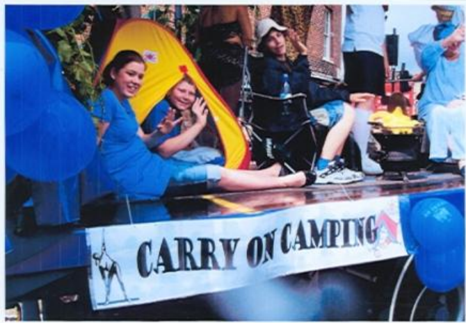
Newbury's Young Peoples Council out in force in the "Carry on Camping" corner representing our open spaces and the beautiful Victoria Park.