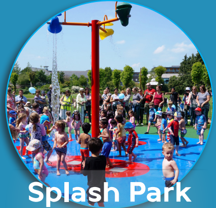
Splash Park 2018 Opening