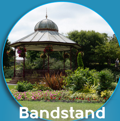
Bandstand Music | Dancing