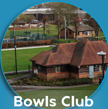
Bowls Club Open Day