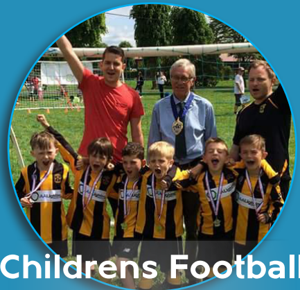
Childrens Football Tournament

Sunday May 13th | 10.30am - 4pm VICTORIA PARK, NEWBURY