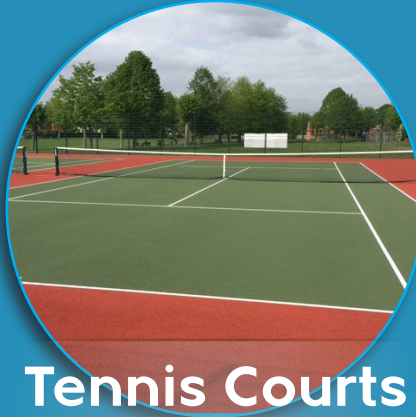
Tennis Courts with Free Sessions