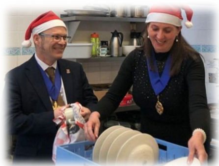
CHRISTMAS – HELPING AT ST GEORGES CHURCH