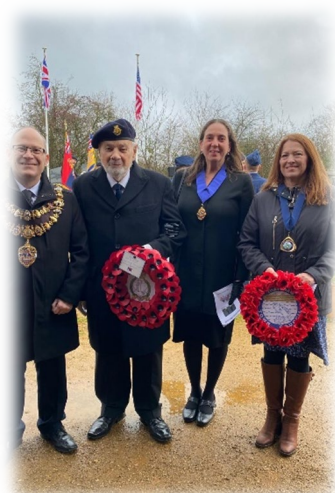
HONOURING ARMISTICE DAY