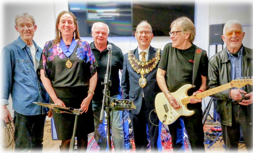
MAYOR'S CONCERT AT BERKSHIRE YOUTH