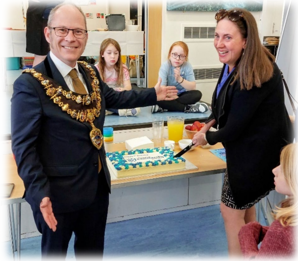
LADY MAYORESS AND I CUTTING CAKE AT BERKSHIRE YOUTH