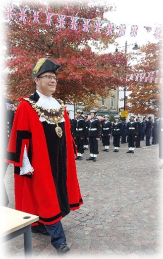
TRAFALGAR DAY PARADE