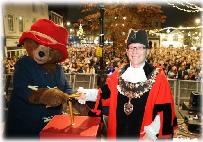
ON STAGE FOR THE CHRISTMAS LIGHT SWITCH-ON